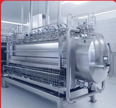
Advanced Retort Technology