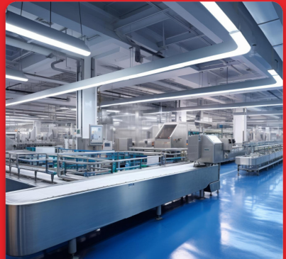
Hygienic Processing Facility