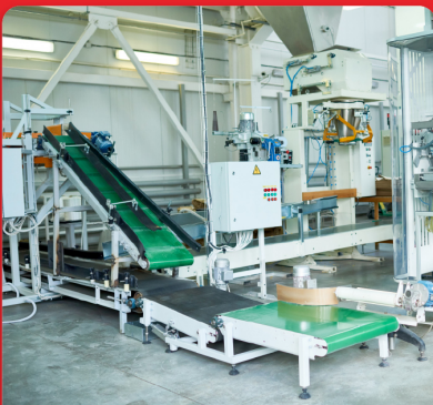
Strict Sorting & Grading